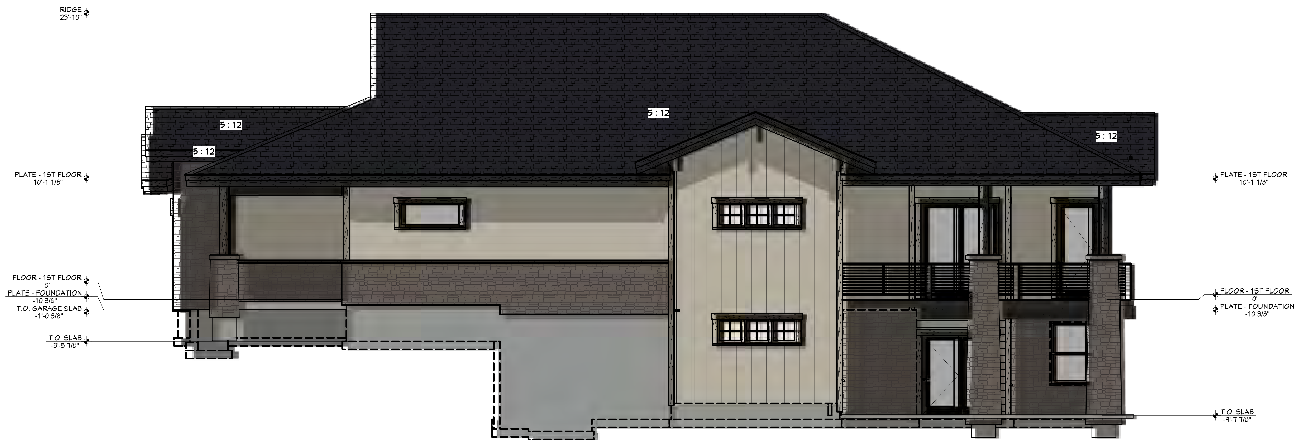
RIGHT ELEVATION 1/4" = 1'-0"