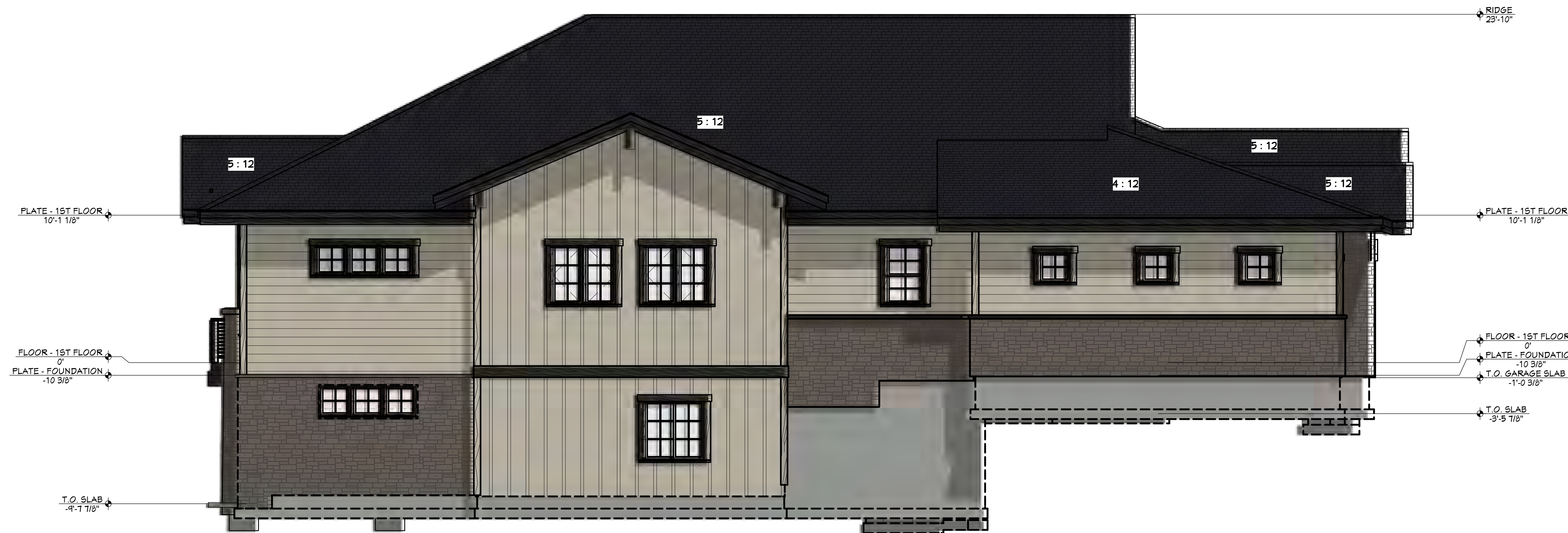
LEFT ELEVATION 1/4" = 1'-0"