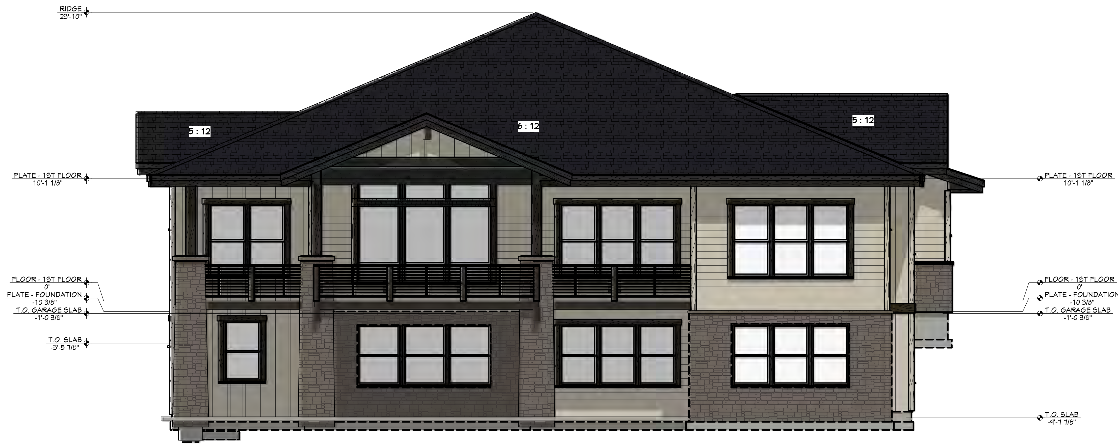
REAR ELEVATION 1/4" = 1'-0"