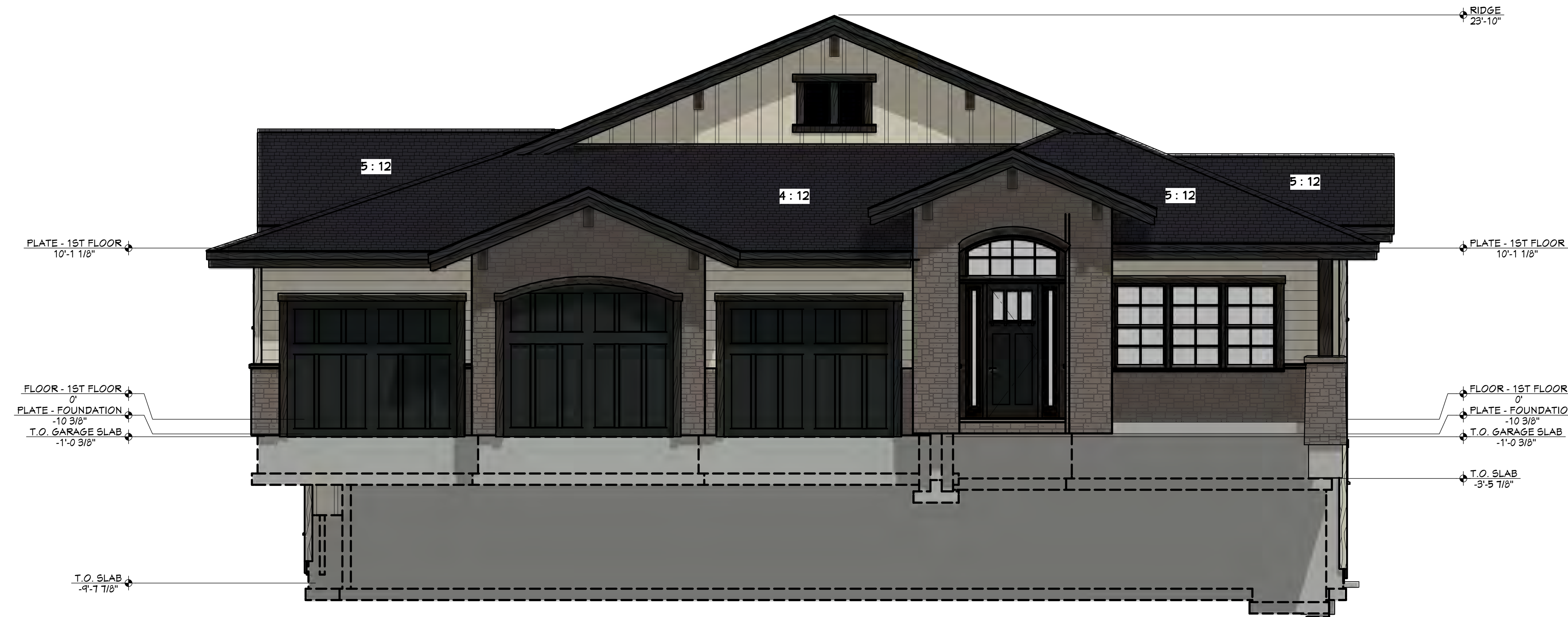
FRONT ELEVATION 1/4" = 1'-0"