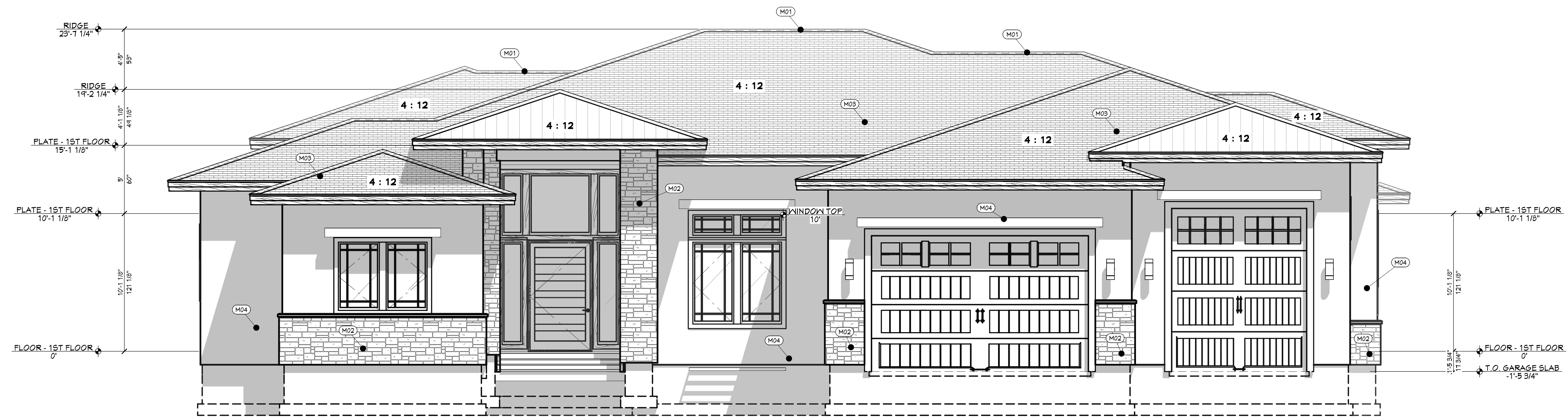
FT FRONT ELEVATION 1/4 IN = 1 FT