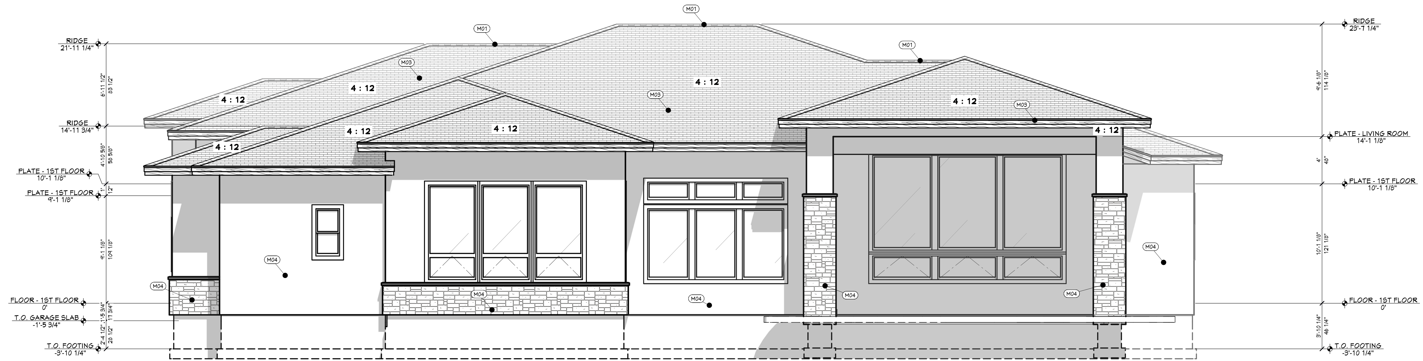
RE REAR ELEVATION 1/4 IN = 1 FT