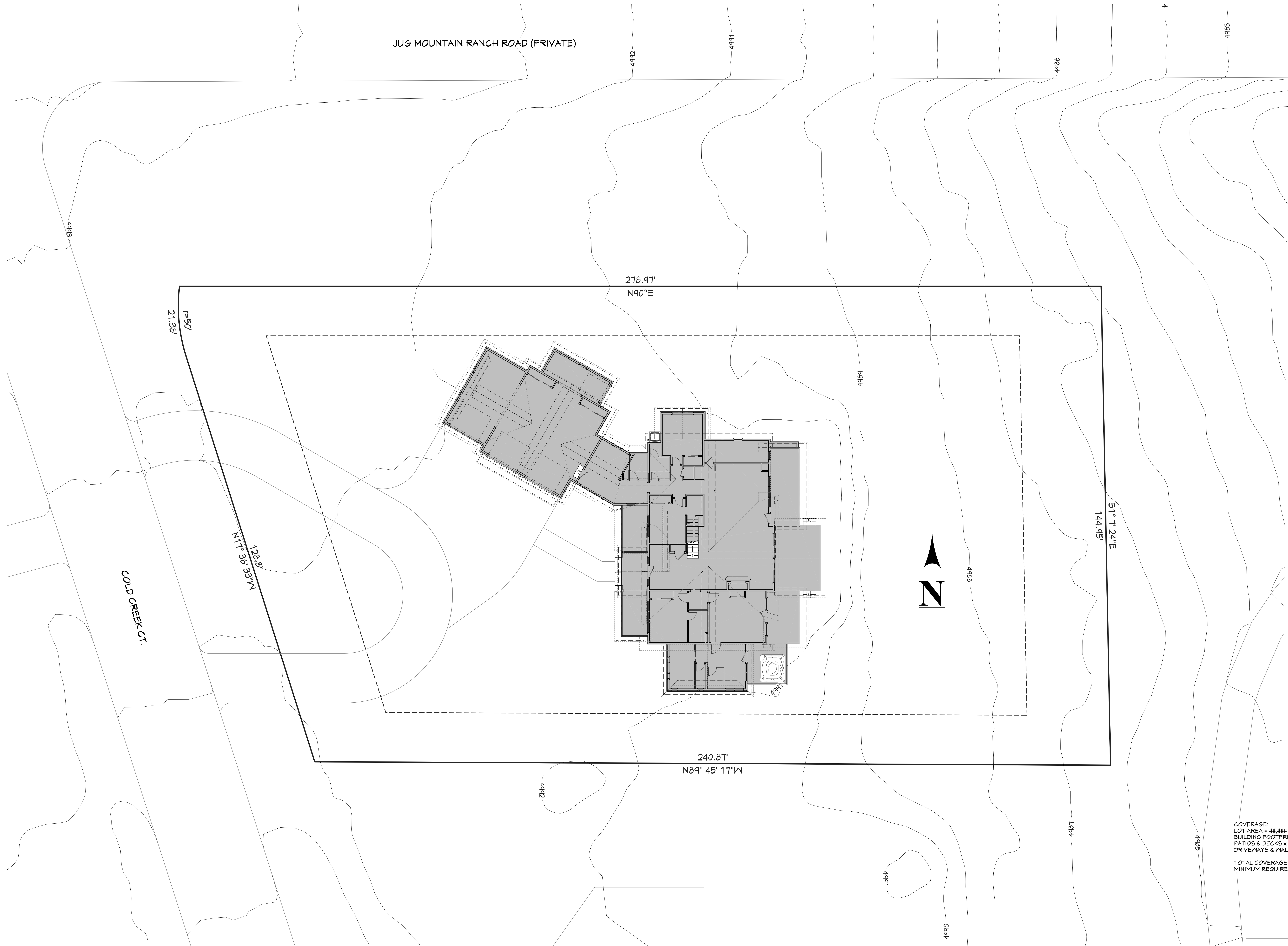
SITE PLAN 1 IN = 10 FT

COVERAGE: LOT AREA = ###,### SF BUILDING FOOTPRINT = ###,### SF PATIOS & DECKS x 50% = SF DRIVEWAYS & WALKWAYS x 35% = ### SF TOTAL COVERAGE = ### OR 22% MINIMUM REQUIRED SNOW STORAGE = ### SF