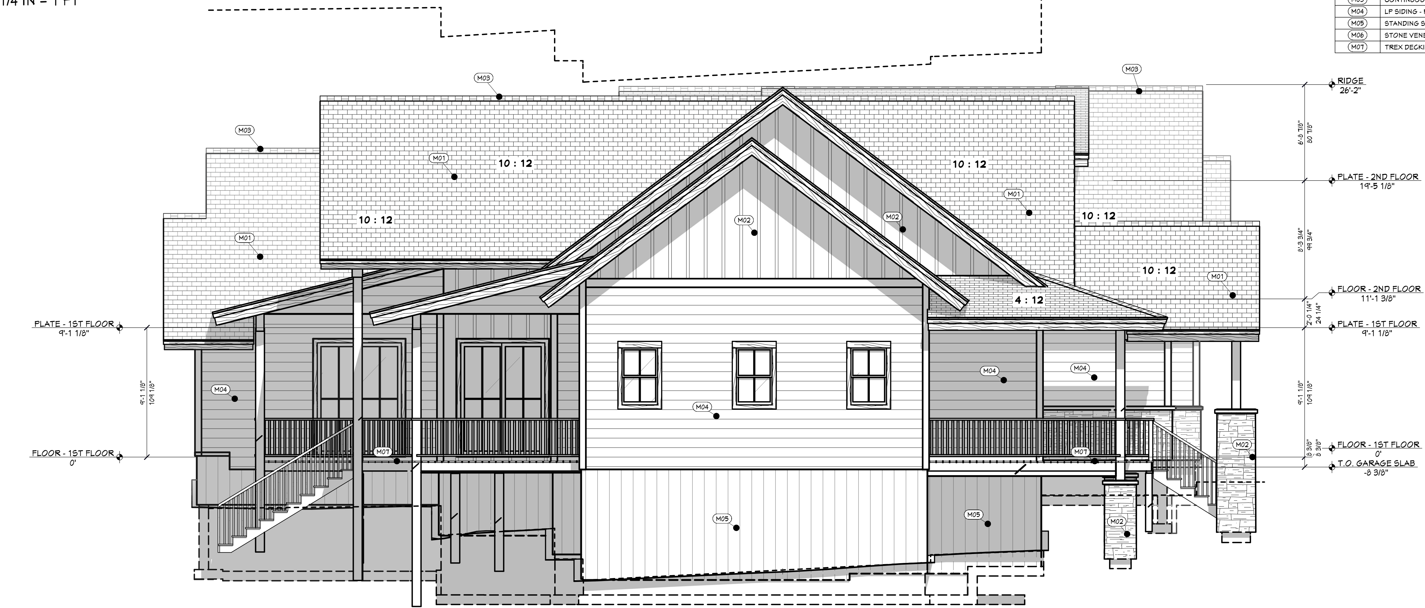
LT LEFT ELEVATION 1/4 IN = 1 FT