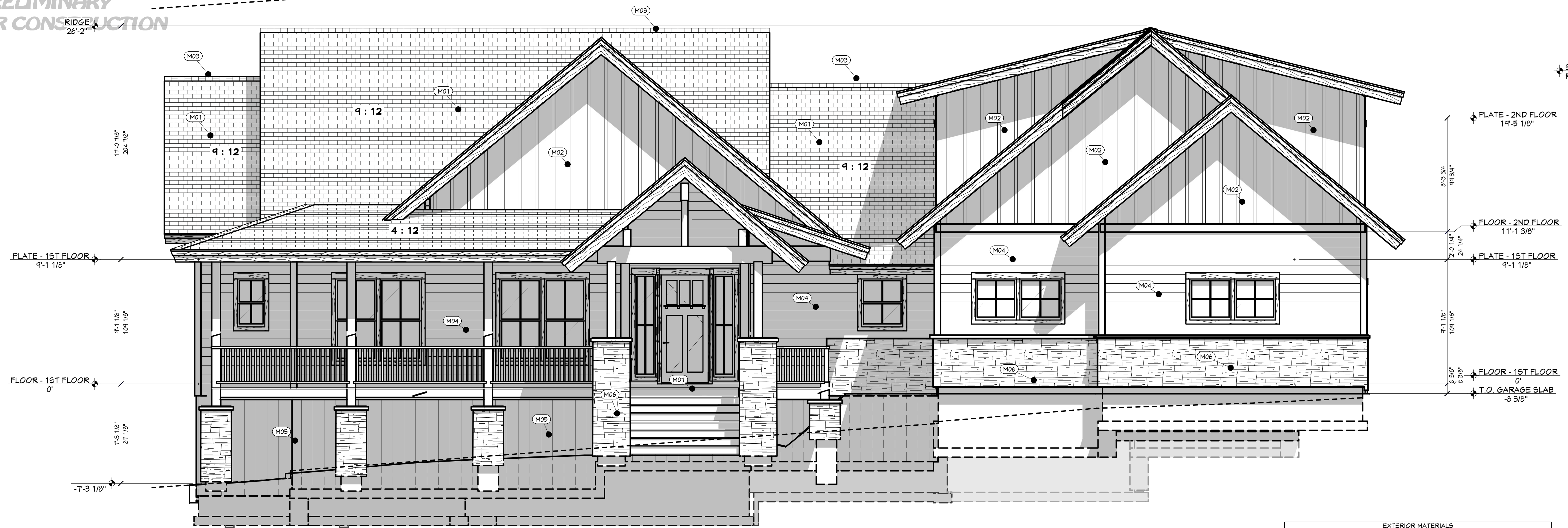
FT FRONT ELEVATION 1/4 IN = 1 FT