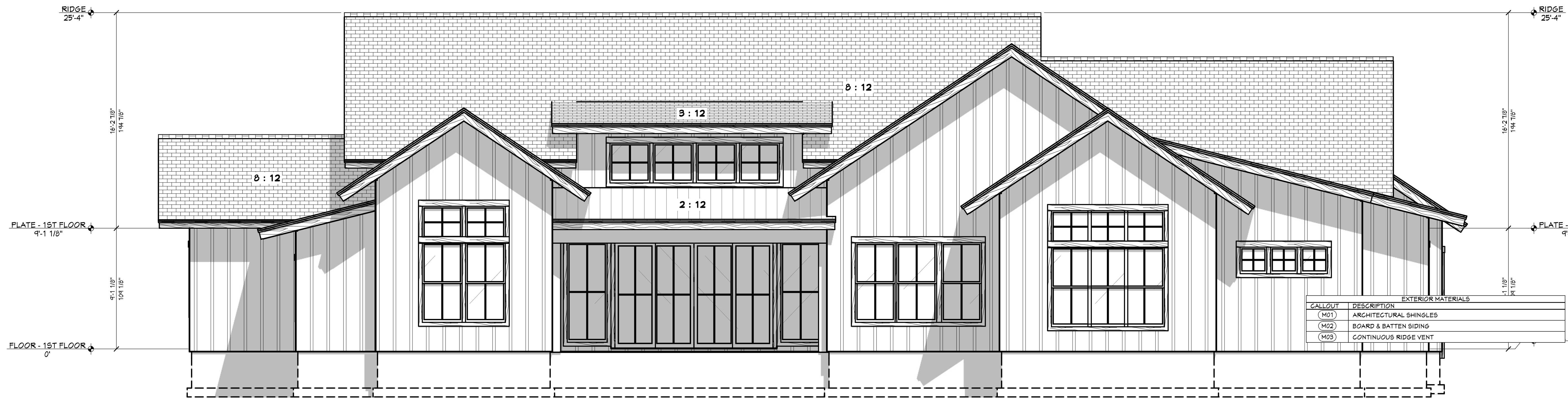
RE REAR ELEVATION 1/4 IN = 1 FT