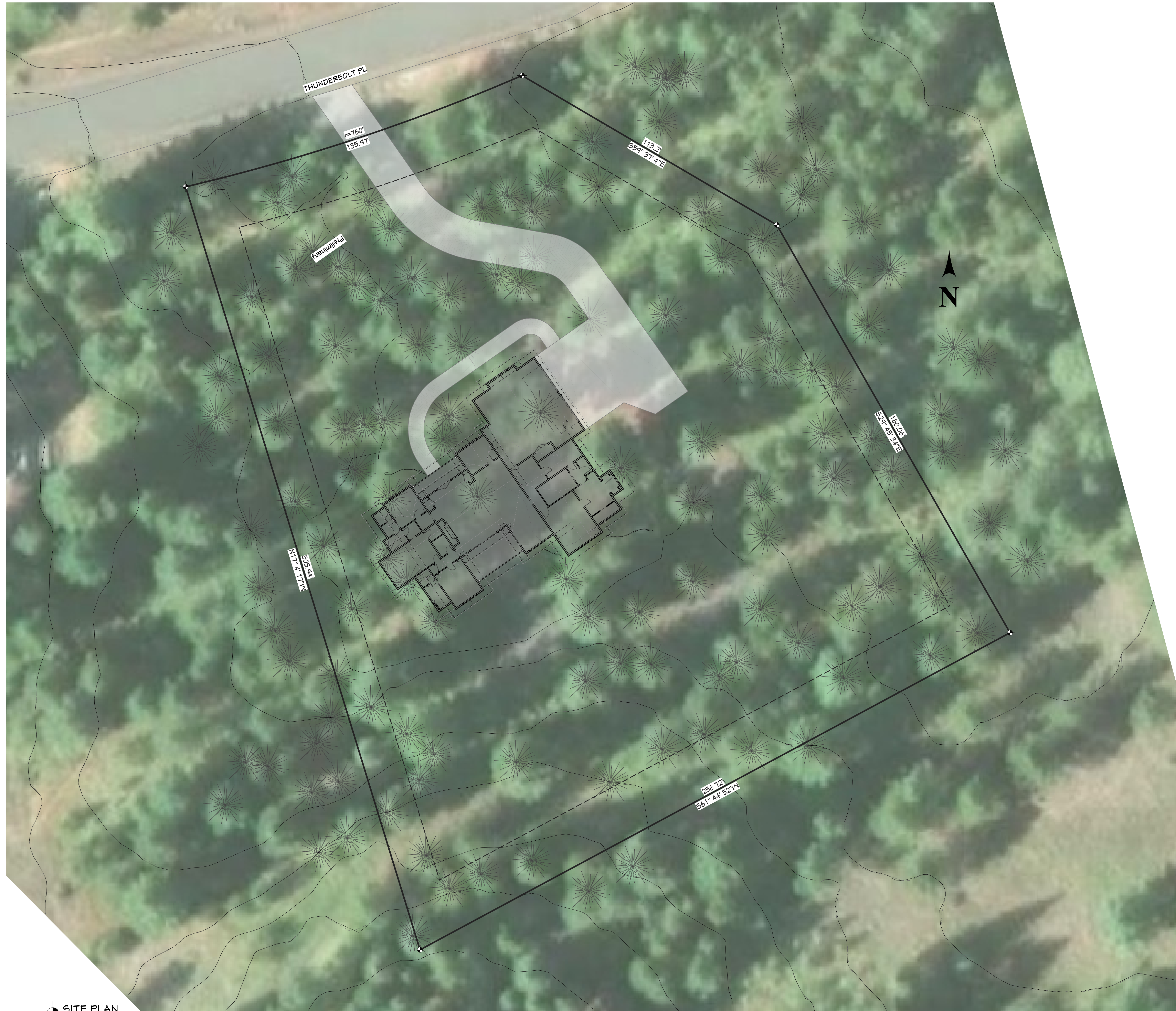
SITE PLAN 1 IN = 15 FT

COVERAGE: LOT AREA = ###,### SF BUILDING FOOTPRINT = ###,### SF PATIOS & DECKS x 50% = 5F DRIVEWAYS & WALKWAYS x 35% = ### SF TOTAL COVERAGE = ###,### OR 22% MINIMUM REQUIRED SNOW STORAGE = ### SF