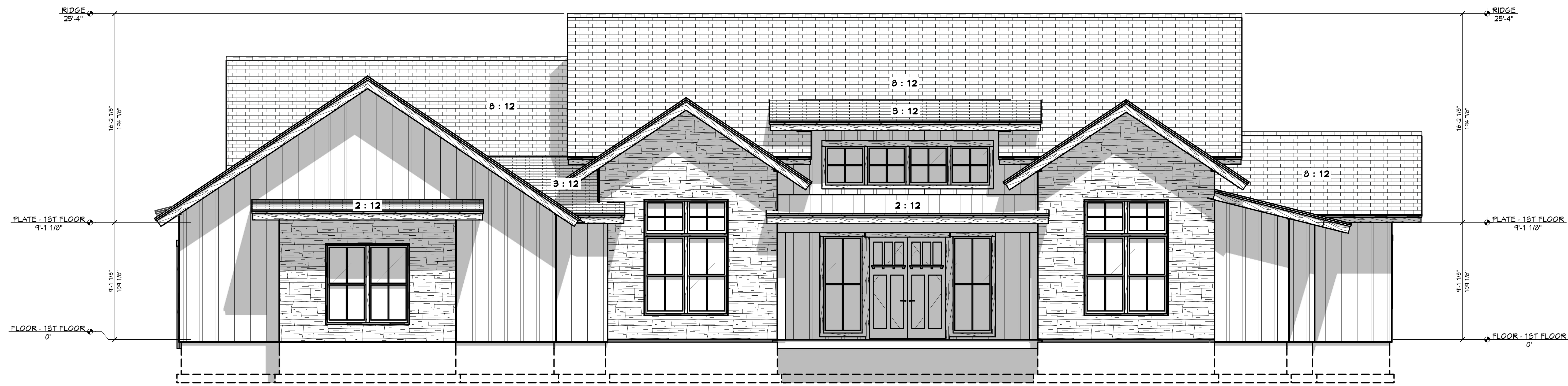
FT FRONT ELEVATION 1/4 IN = 1 FT