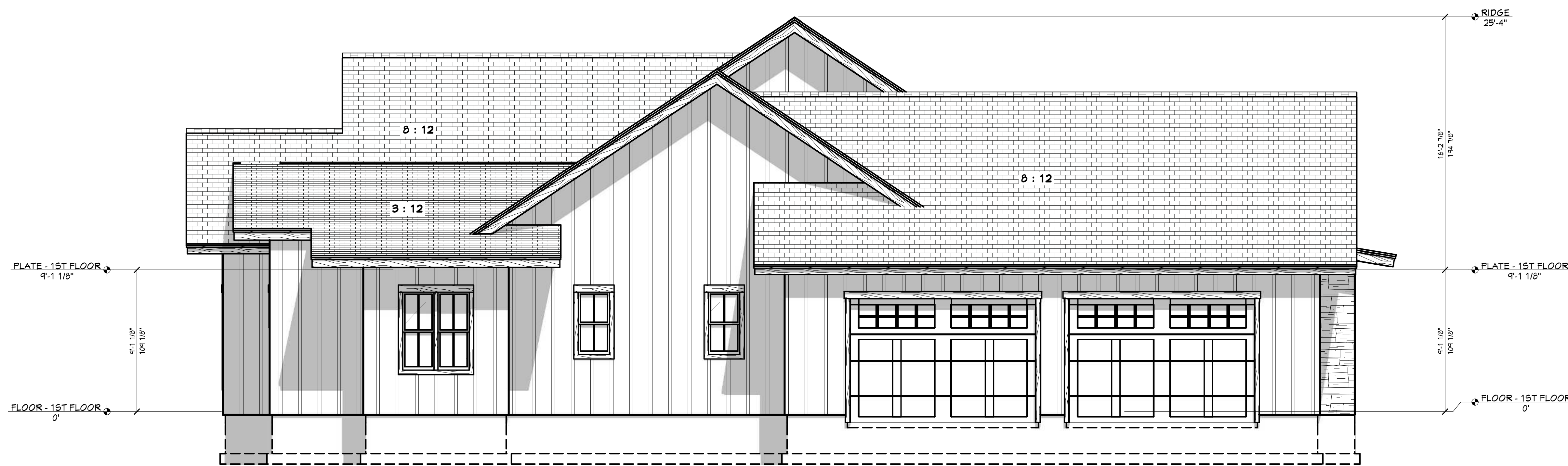
LT LEFT ELEVATION 1/4 IN = 1 FT